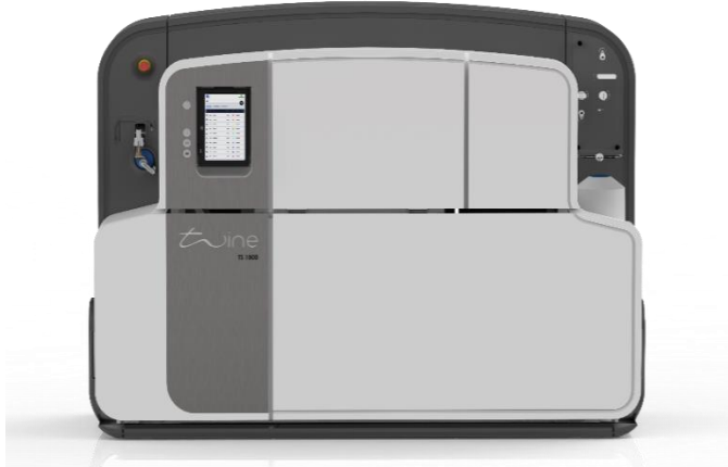
Figure 1 TS-1800 Digital Thread Dying System

The TS-1800 comprises a single stand-alone unit, as shown in the figure below.