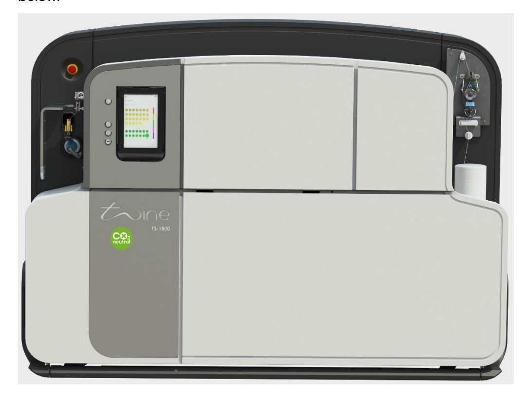
Figure 1: TS-1800 Digital Thread & Yarn Dying System

The TS-1800 comprises a single stand-alone unit, as shown in the figure below.