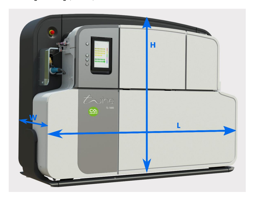
Figure 2: TS-1800 Dimensions