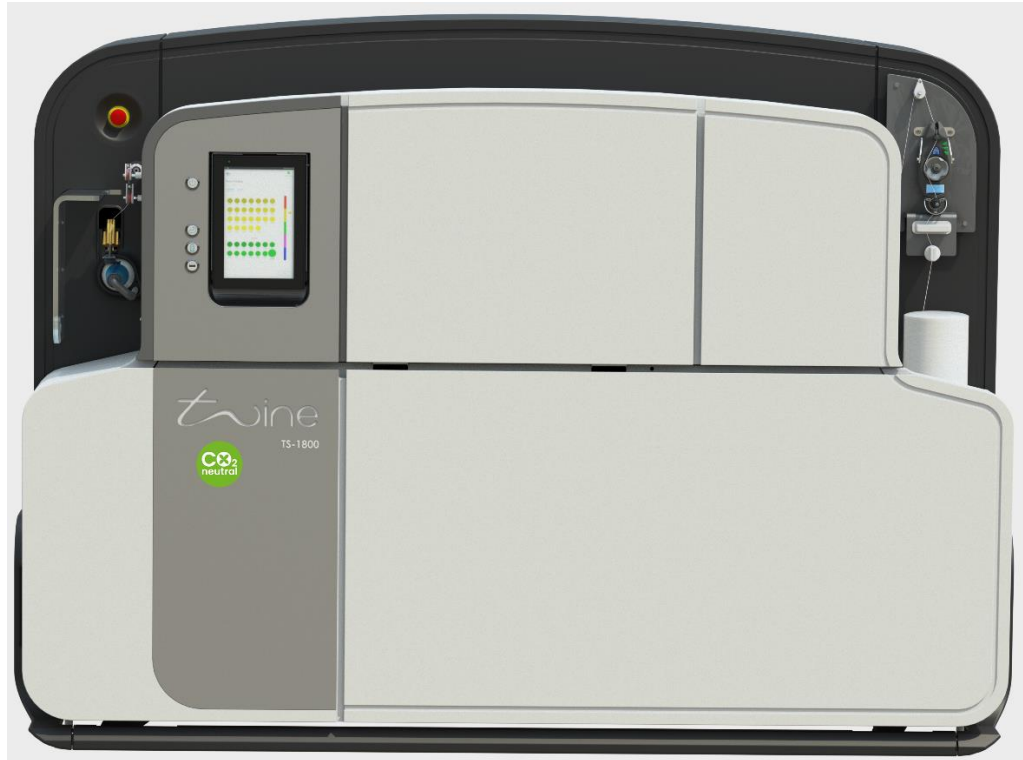
Figure 1: TS-1800 Digital Thread & Yarn Dying System

The TS-1800 comprises a single stand-alone unit, as shown in the figure below.